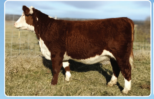
PPH 109 NELLIE 304 Sired by CRR 719 Catapult 109 CE 4.8 BW 2.2 WW 52 YW 78 MM 23 REA 0.38 MARB -0.17 CHB $82 Due this Spring to Green JCS Makers Mark 2295

TIER GEORGE 52L Sired by H DS Entice 2362 ET CE 7.0 BW -0.6 WW 50 YW 88 MM 32 REA 0.87 MARB 0.09 CHB $121 Fall 18 MO Bull